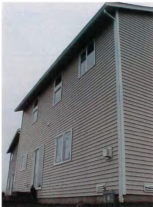
Lot 72 West Face 03-19-08