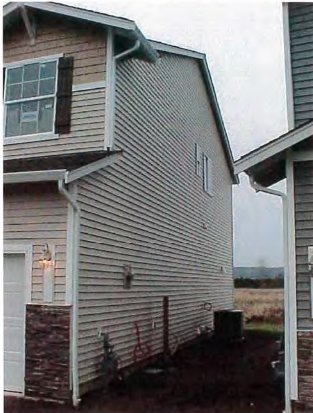
Lot 72 North Face 03-19-08