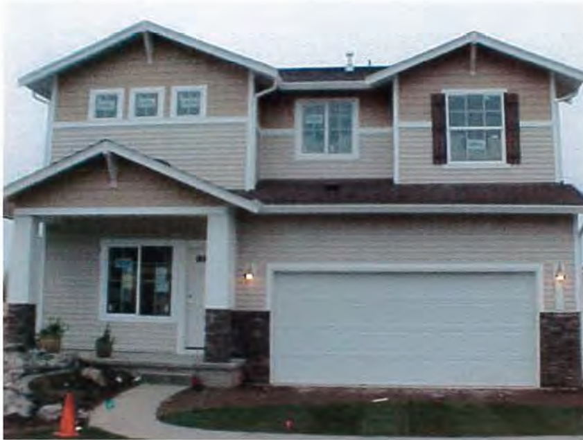
Lot 72 East Face 03-19-08

If using the Elevation Certificate to obtain NFIP flood insurance, affix at least two building photographs below according to the instructions for Item A6. Identify all photographs with: date taken; "Front View" and "Rear View"; and, if required, "Right Side View" and "Left Side View." If submitting more photographs than will fit on this page, use the Continuation Page, following.