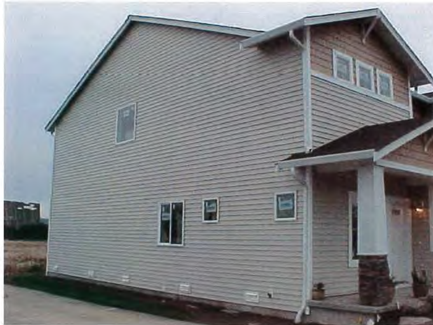
Lot 72 South Face 03-19-08